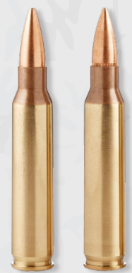
.223 Rem cartridge design

BT (Boat Tail) - monolithic spitzer bullet. Minimal damage due to increased penetration and excellent stopping power. Minimal bullet dimensions and weight variation. Best choice for big game hunting.