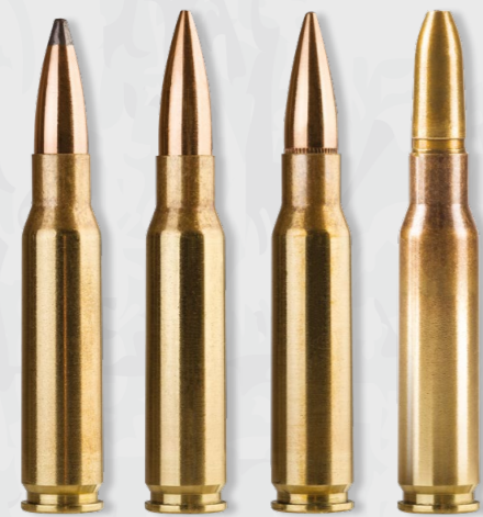
.308 Win cartridge design